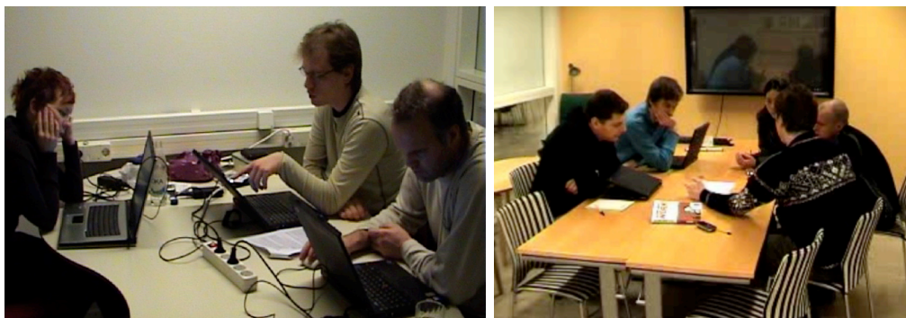
Figure 2. Students in an analysis meeting sharing and talking around viewed wiki pages on their laptops and printed out.

versity setting, and could easily meet to discuss their fieldwork, their use of the wiki and their fieldnotes. In these meetings the wiki pages were used as a physical resource to be drawn upon. The students printed out a large number of the pages of the wiki, and these would be distributed as they talked about their fieldwork.