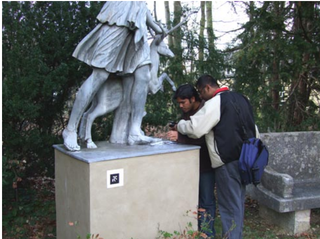
Figure 5. The Treasure: Two players getting a new quest from a statue.

At this point we gave them an overview of the Magic Lens Box, and let them ponder about the best way to implement their game. In the beginning the students had some problems understanding the difference between mobile and stationary containers . After getting examples, however, on how to use them best, the students quickly noticed that all the characters in the game (real statues) were best represented by stationary containers , while the items the players would have to use for solving the riddles became mobile containers (as these would be carried around by the players).