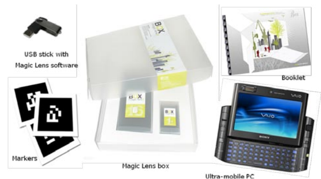
Figure 1. The Magic Lens Box (center) and its content (left and right)

Our two main objectives are somehow contradictory, since supporting a high flexibility in the design makes a system rather more complex and does not simplify it. To achieve the objectives stated above we had to cut down and limit certain aspects. During the iterative design we decided on a certain MR hardware system as well as on a certain set of interaction techniques that are the same for all the games based on the Magic Lens Box.