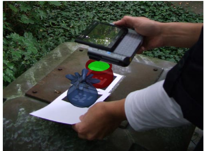
Figure 3. The Alchemists: A player puts an ingredient from the bag into the cauldron by using the basic interaction of the Magic Lens Box.

Especially the scoring process demanded that you could attach a rule to several game objects at the same time, something we had overlooked in the first design process for the Magic Lens Box and quickly implemented. It also proved very useful that instead of having to specify a concrete game object or property inside a condition or action of a rule , you could always instead automatically use the game object or property that invoked the rule .