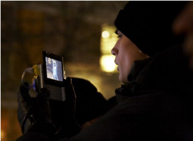
Figure 4. Interference: A player using the UMPC to map out the virtual network.

Additionally the sleek design of the UMPCs was seen as really fitting the setting of the initial game scenes. In some groups mapping out the network became a group effort with different players stating their opinion on where to go next, while in other groups one person with good orientation skills took the lead.